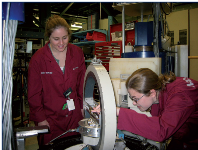
Students learning to use neutron beams at Chalk River.

intervention to re-start the reactor. Even after this clear warning, no real action was taken, no succession plans were developed. With NRU shut down again, and not expected to return to service until April of 2010, the government is still working on privatising AECL and now appears to view NRU simply as an “isotope issue”.